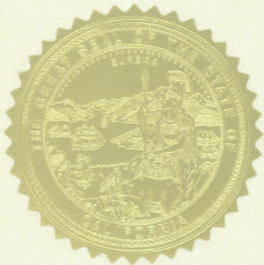
Arnold Schwarzenegger GOVERNOR OF CALIFORNIA

IN WITNESS WHEREOF I have here unto set my hand and caused the Great Seal of the State of California to be affixed this 6th day of July 2007.