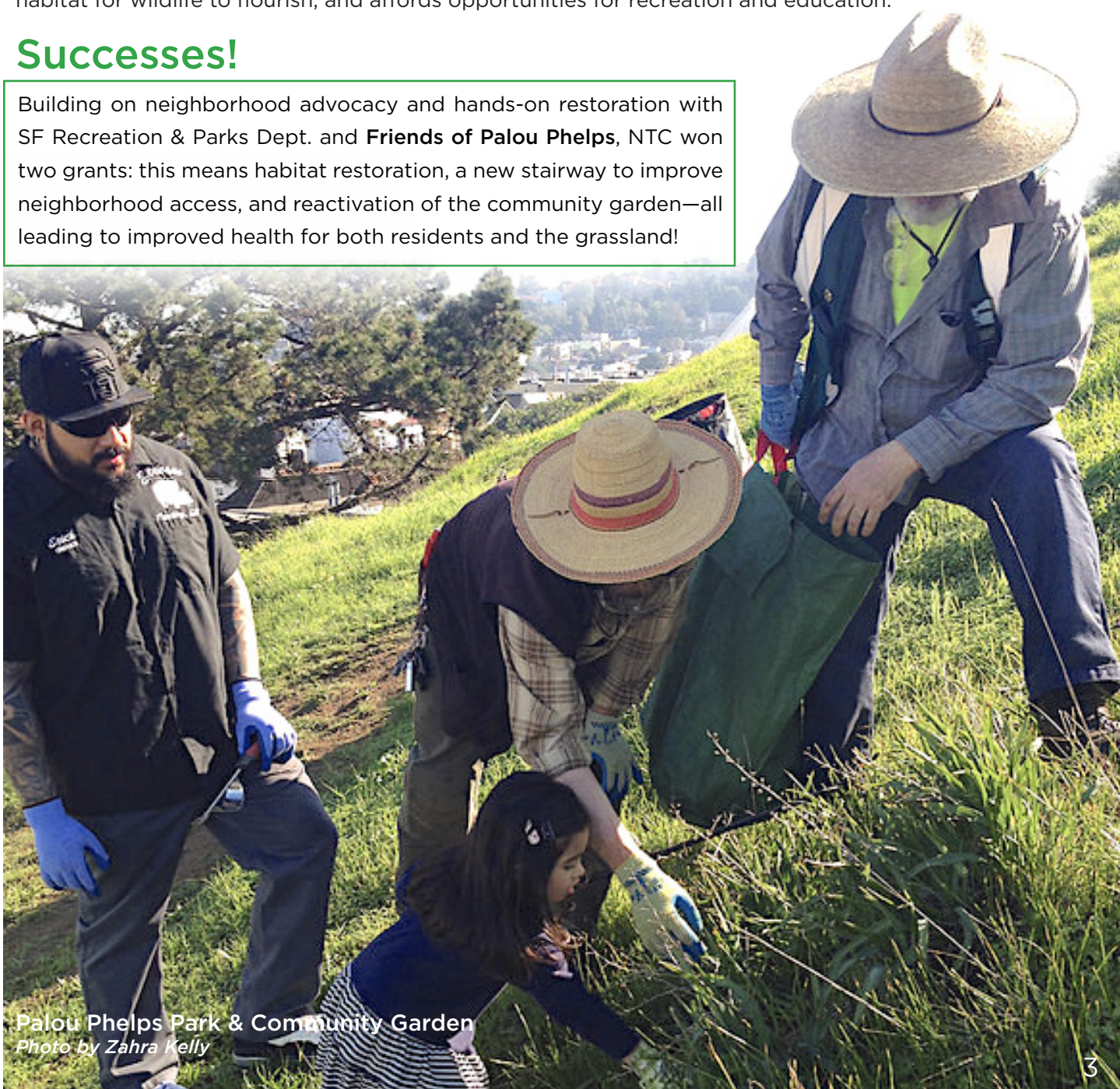
Palou Phelps Park & Community Garden

Building on neighborhood advocacy and hands-on restoration with SF Recreation & Parks Dept. and Friends of Palou Phelps , NTC won two grants: this means habitat restoration, a new stairway to improve neighborhood access, and reactivation of the community garden—all leading to improved health for both residents and the grassland!