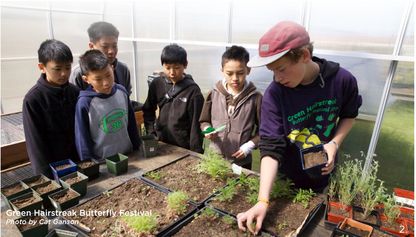
Green Hairstreak Butterfly Festival

SF State University students completed their 4th year of habitat monitoring in the Corridor, and the data is in! The butterflies have increased throughout the neighborhood with a few hot spots, where they fly in higher numbers.