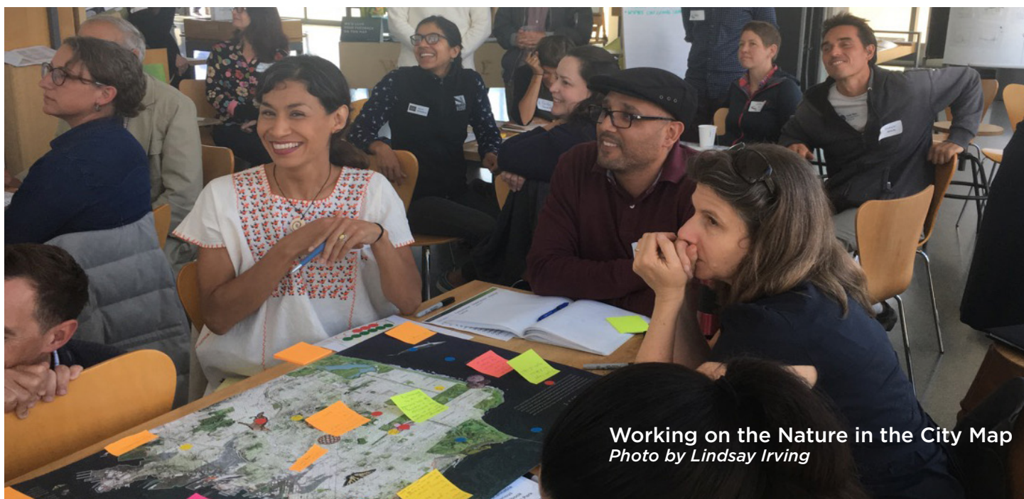
Working on the Nature in the City Map

Our map team includes experts from California Academy of Sciences, Exploratorium, Lichen Projects, Presidio Trust, SF Dept. of the Environment, SF Planning Dept., SF Public Library, and more.